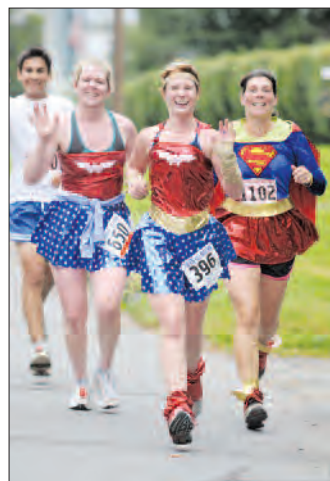
Over 1,000 superheroes braved a drizzly day to set a Guinness record for CHaD (right), and some half-marathoners even ran in superhero garb (above).