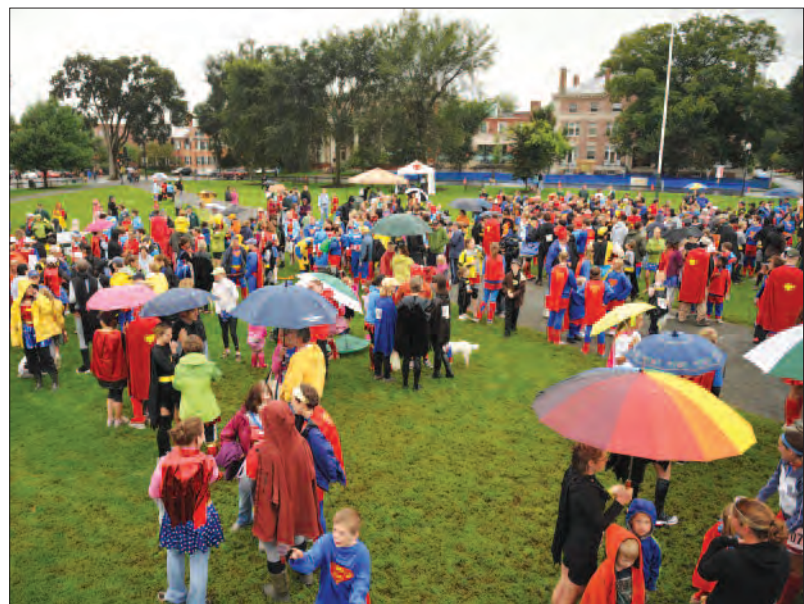
MAPLE LEAF PHOTOS