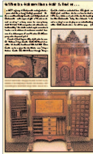
Two readers share below more about the provenance (and Dartmouth ties) of this striking desk that was the subject of a story in our Fall issue.

At any rate, my father went on to serve as a medical officer during World War I and eventually met the right girl and mar-