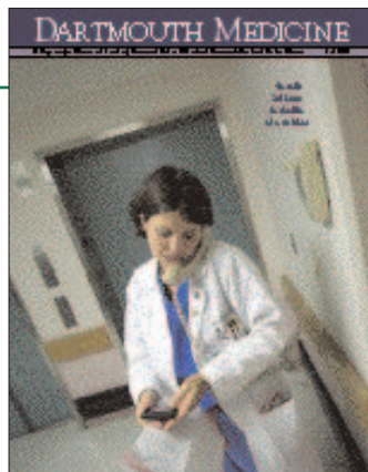
A day on call for the resident pictured on our Fall cover drew several letters.