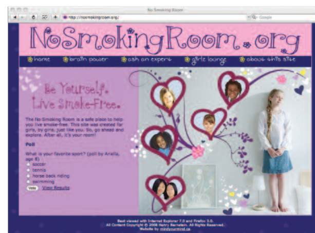
The site’s design is the result of input from its target audience.