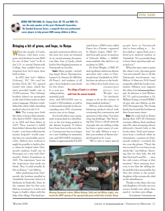
A DMS alum enjoyed this story about a clinic in Kenya that was founded by a pair of Dartmouth College alums.

Northern New Hampshire and Vermont clearly can be better served, and I salute those continued on page 61