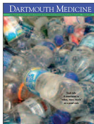
This cover story on the greening of health care was praised by an environmental consultant from California.

In later years, I would describe this sort of appearance as cachexic; the man was likely in a