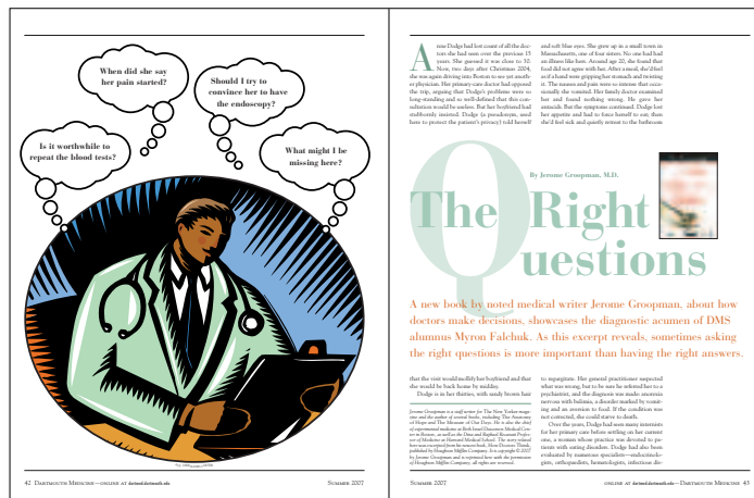
One reader describes this article in our Summer issue as "enlightening." Excerpted from a new book by Jerome Groopman, it focuses on a DMS alumnus.

According to Dartmouth's alumni records, Basil O'Connor died (in 1972) in Phoenix, Ariz.—a fact