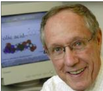
Folic acid doesn’t foster colon health, found Baron.