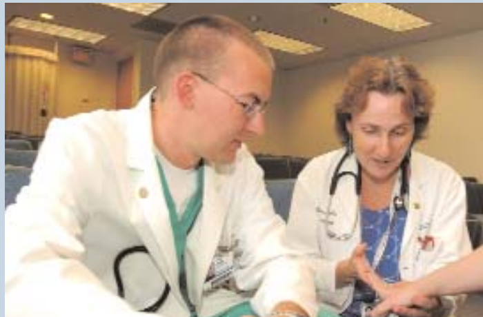
ALL FLYING SQUIRREL GRAPHICS